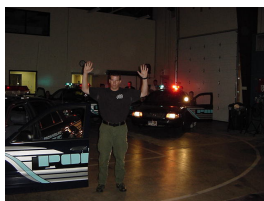
S.T.O.P.S Practical Training Inside The Bay Area of the Training Facility

In 2006, the Training Facility only produced $200 in usage fees, but saved $5,135 in training fees due to host agency free seat benefits. By hosting seminars, the department can significantly reduce the strain on the training budget. To promote increased usage of the facility, availability information has been posted on the department website. The facility has proven to be a vital asset, not only for