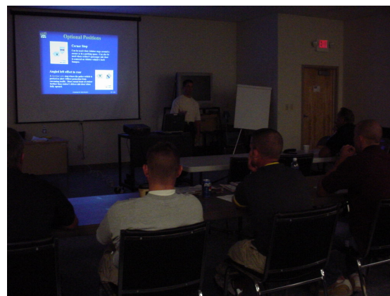
S.T.O.P.S Classroom Training

“Sworn and Reserve Personnel received an average of 138 hours of training per person, accounting for 5, 528 total hours of training.”