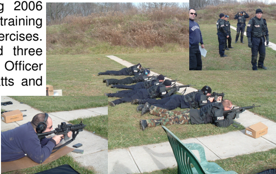
Emergency Response Team Firearms Training

completed each task to standard. Many of them exceeded the