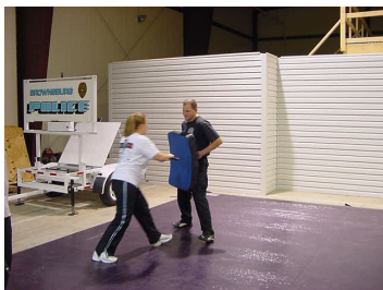
Defensive Tactics Practical Training

The Brownsburg Police Department continues to be one of the best trained departments in the county. Sworn and Reserve personnel received an average of 138 hours of training per person, accounting for 5,528 total hours of training.